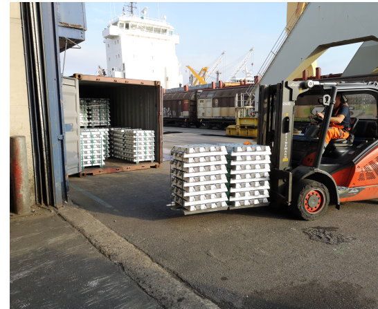
Stuffing & Stripping