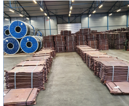
Authorized Economic Operator